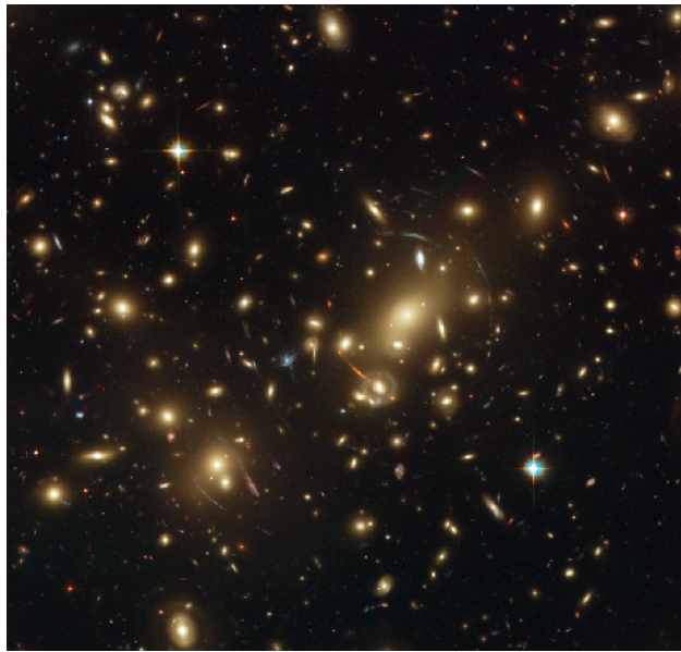
Figure 28.24 Cluster Abell 2218. This view from the Hubble Space Telescope shows the massive galaxy cluster Abell 2218 at a distance of about 2 billion light-years. Most of the yellowish objects are galaxies belonging to the cluster. But notice the numerous long, thin streaks, many of them blue; those are the distorted and magnified images of even more distant background galaxies, gravitationally lensed by the enormous mass of the intervening cluster. By carefully analyzing the lensed images, astronomers can construct a map of the dark matter that dominates the mass of the cluster. (credit: modification of work by NASA, ESA, and Johan Richard (Caltech))

The third method astronomers use to detect and measure dark matter in galaxy clusters is to image them in the light of X-rays. When the first sensitive X-ray telescopes were launched into orbit around Earth in the 1970s and trained on massive galaxy clusters, it was quickly discovered that the clusters emit copious X-ray radiation (see Figure 28.25 ). Most stars do not emit much X-ray radiation, and neither does most of the gas or dust between the stars inside galaxies. What could be emitting the X-rays seen from virtually all massive galaxy clusters?