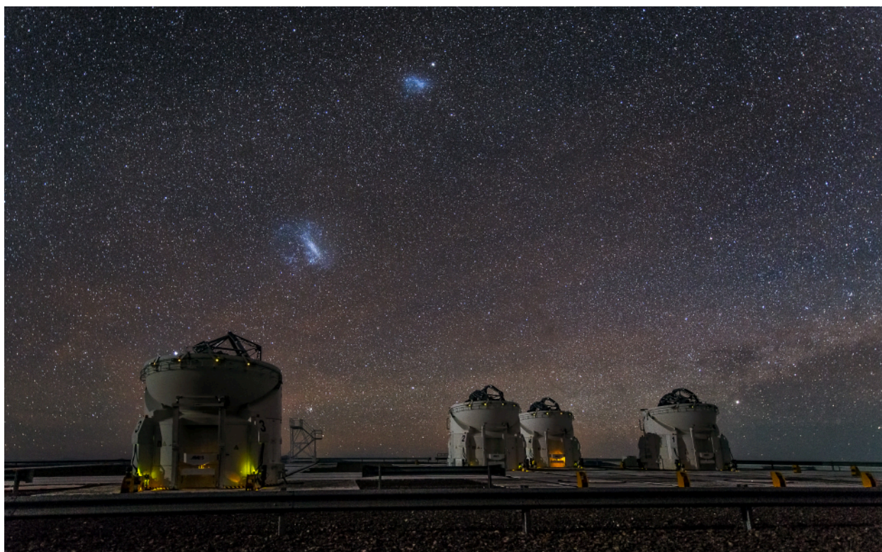
Figure 28.26 Large and Small Magellanic Clouds. Here, the two small galaxies we call the Large Magellanic Cloud and Small Magellanic Cloud can be seen above the auxiliary telescopes for the Very Large Telescope Array on Cerro Paranal in Chile. You can see from the number of stars that are visible that this is a very dark site for doing astronomy.

This result, along with a variety of other experiments, leads us to conclude that the types of matter we are familiar with can make up only a tiny portion of the dark matter. Another possibility is that dark matter is composed of some new type of particle—one that researchers are now trying to detect in laboratories here on Earth (see The Big Bang ).